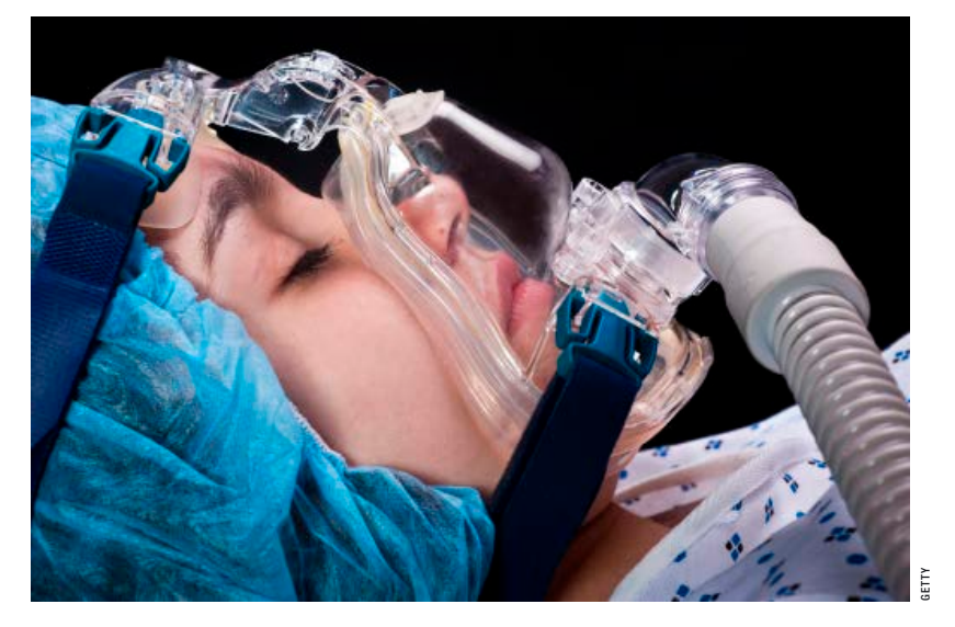
At sleep clinics, patients can have their breathing monitored overnight.

obstructive sleep apnoea. It's growing. It's not growing exponentially, but it is growing, the number of kids we support that way, which is a challenge for us and it's a challenge for their families."