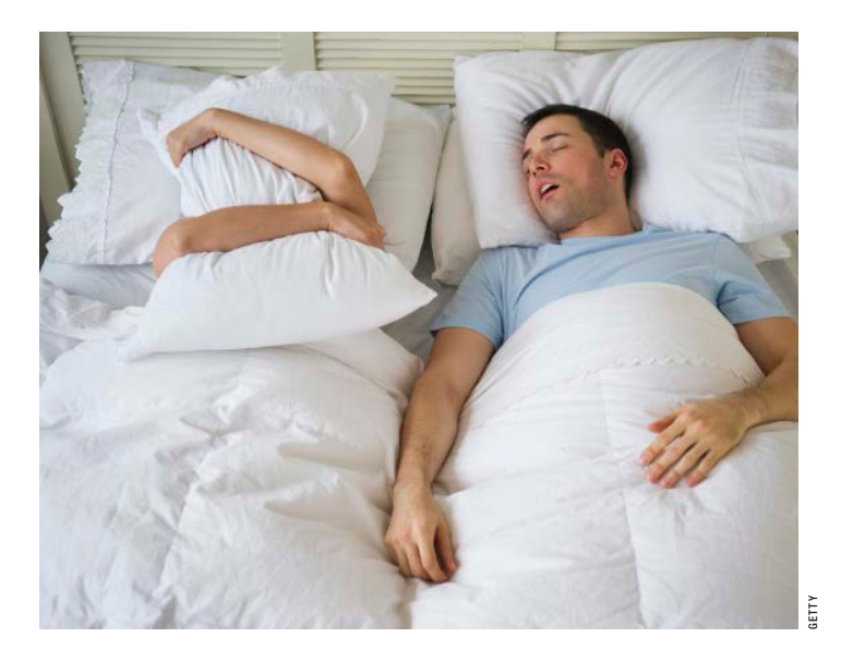
Sleep apnoea can make sufferers flail about, bruising their partners.

chamber - then head to your GP. Of course, soporific MPs don't nec-